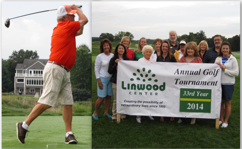
Action at Cattail Creek...

The Safeway Foundation, Eastern Division, contributed $2,500 to Linwood Center, Inc., to support the Technology Center in the school library. Technology integration has been shown to improve communication, assist in the development of social skills, and enhance the ability for individuals with autism to learn. Safeway's 11,000 employees in the Eastern Division fund the Safeway Foundation through payroll deductions, making this grant possible. Linwood Center students and staff thank Safeway employees for their support. Fall 2014