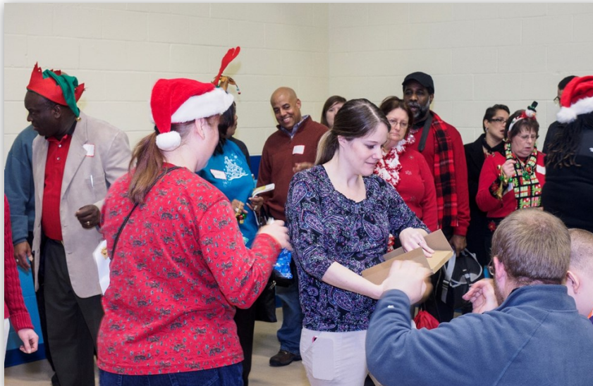
Northrop Grumman Employee Christmas Project brightens holidays for children with autism.

Linwood School students and residents benefit from the generous contributions of the Northrop Grumman Employee Christmas Project. The Christmas Project contributed in excess of $8,500 to the Linwood Center School program. Technology was at the top of the Christmas list for Linwood School students when the Northrop Grumman Employee Christmas Project arrived at Linwood just before Christmas. Apple iPads with protective cases were among the numerous contributions from NG Christmas Project. Santa's gift list included communication assistance software and sensory integration tools which enhance sensory integration and the development of motor skills. Technology integration has been shown to improve communication, assist in the development of social skills, and enhance the ability to learn for individuals with autism. Each of the 36 children enrolled at Linwood School at that time received a stocking full of goodies and a backpack from the NG employees. Winter 2014