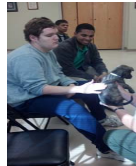
(pictured on left). The students look forward to continuing to practice and apply research skills in December as they learn more about the scientific process.