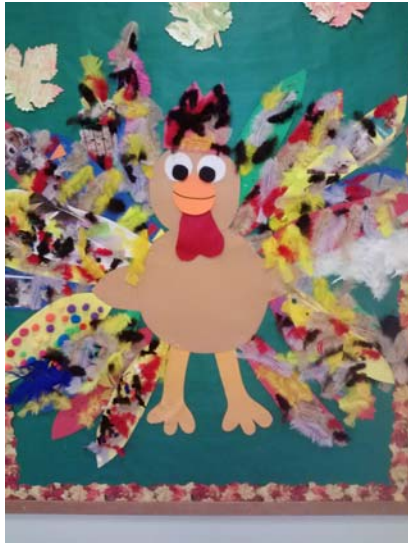
Pictured above is "Timmy the Turkey", which was created by the students in order to make our hallway festive for the holiday seasons